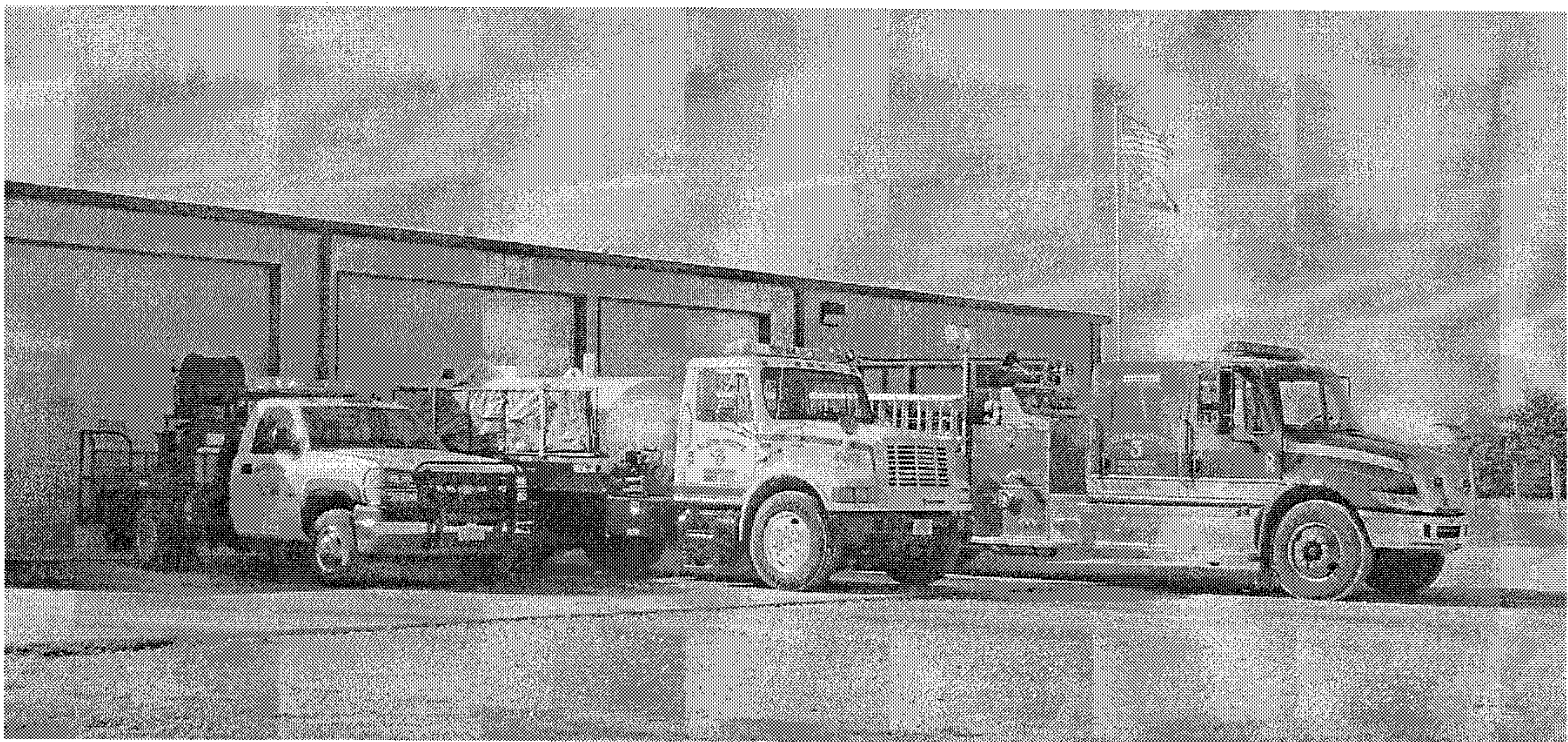
Booster 343, Tanker 331, and Engine 320 in front of Station 2 on Elmo Weedon Road