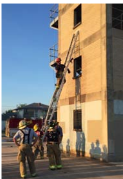
ground ladders and advancing

Thursday night training, we conducted several special training in 2015.